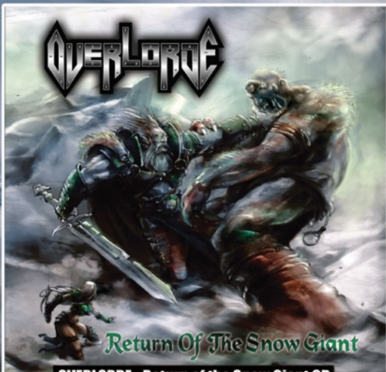
OVERLORDE - Return of the Snow Giant CD RELEASE DATE: 17/12/2004 - (SARECD003)